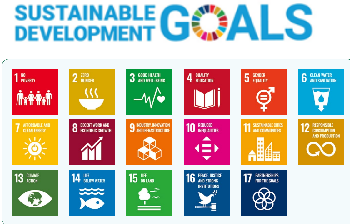
▼ Chart 2. United Nations Sustainable Development Goals